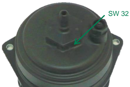
View with closed cover