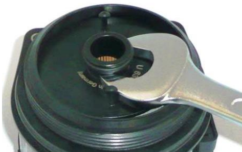
View after removing foam part

a) Lift with open-ended wrench or Tool size: SW 19 or SW 21