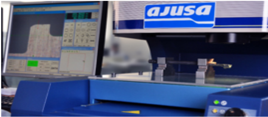
Illustration 1 Machine Vision Measurement

The search of more efficient engines, as well as the commitment to the environment, have led to stronger requirements when it comes to manufacture sealing gaskets, because an incorrect design can make the efficiency of the vehicle drop. Therefore if it is necessary for a manufacturer like Ajusa to use the latest technological tools regarding the design and verification of the product.