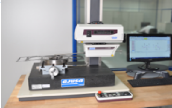
Illustration 3 Profile Measurement

Another measurement and verification tool is the profilometer, which ensures a higher precision process where the gasket seals, and with this tool we can study the morphology in the embossings made in the metallic gaskets, which is the path the market is currently following, where slight changes in the embossing angles values, heights and morphology can make the gasket performance noticeably change.