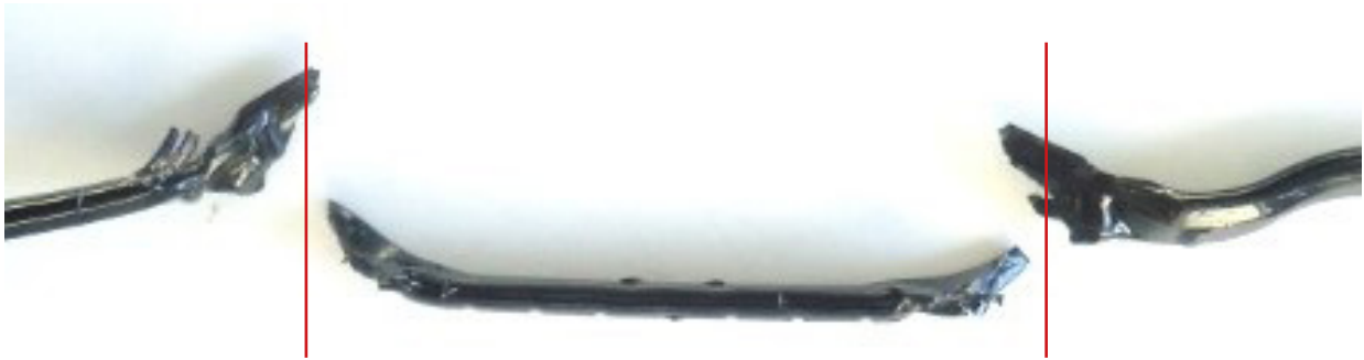
Gasket sectioned by the cover, due to improper positioning during assembly

Other common fault, is to incorrectly place the gasket in its housing, so if we do the tightening processes with the gasket out of the socket, the cover would act as a shear cutting the gasket itself.