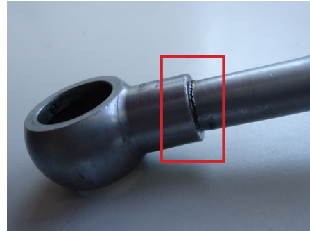
Example of fatigue rupture in the banjo-pipe junction area

Most oil pipes have non-welded brackets and fixed fasteners welded to the tube.