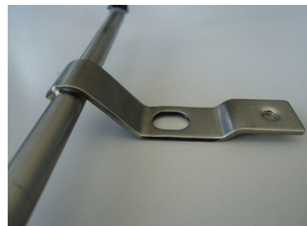
Example of welded fixed fasteners