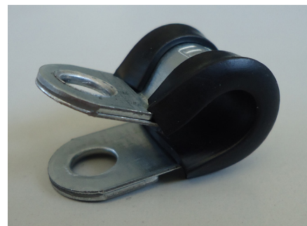
Example of non-welded brackets

Sometimes the brackets should be reused, so it is important to pay attention to the disassembled pipe to ensure that all fixings provided by the old pipe or supplied with the new AJUSA pipe are properly installed.