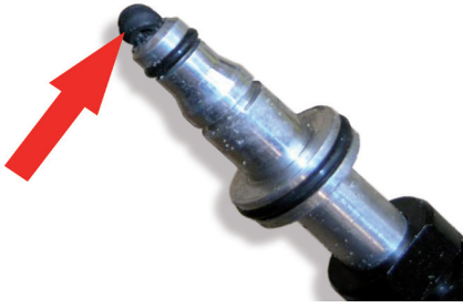
Image 4: If the old seal is not removed, it can get pressed into the CSC and block the tube

The system must be bled when the CSC is replaced. The procedure for doing so is split into two separate steps: bleeding the clutch and bleeding the CSC.