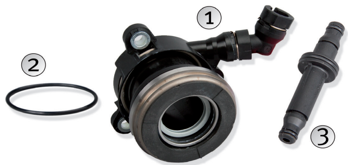
Image 2: LuK CSC 510 0073 10 Current Design

The concentric slave cylinder (CSC) is subjected to just as much natural wear as the clutch or flywheel and should be replaced every time the clutch is changed.