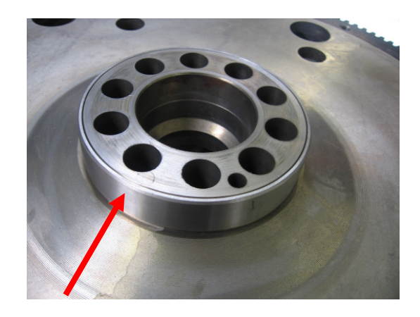
Flywheel with race