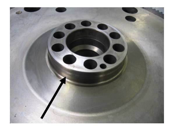
Flywheel without race

OM 447 LA | 457 LA | 460 LA OM 501 LA | 502 LA