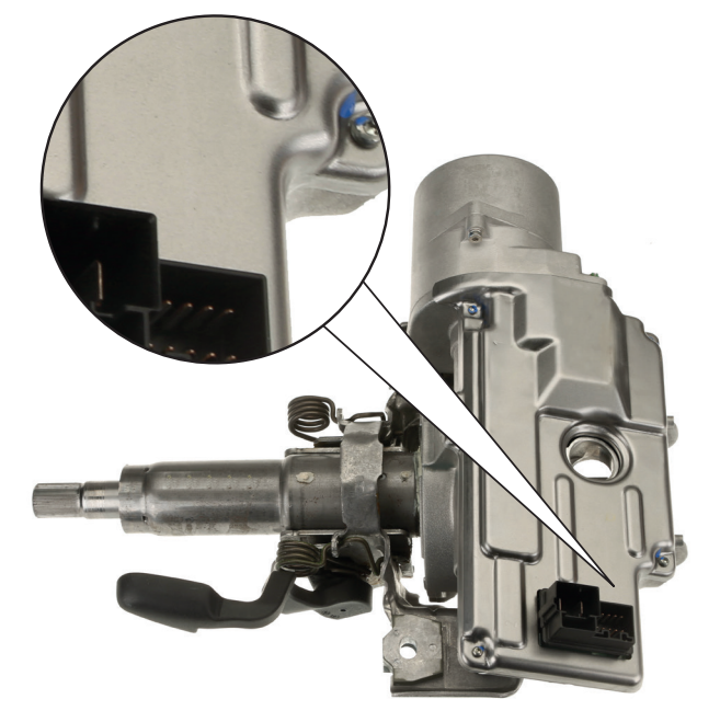
Steering column without external sensor connection

Steering column with external sensor connection