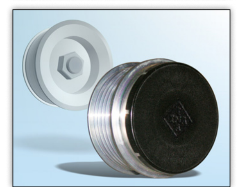
Image 2: A protective cover must be provided with OAPs and OADs to protect them from dirt.

The corresponding adapter must be selected from the tool kit when removing or testing the OAPs or OADs.