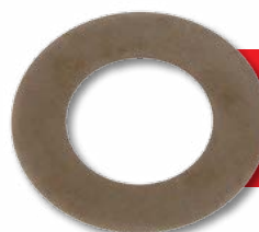
febi no. 31815 Ref. no. 074 105 193

In order to avoid costly consequential damage, the febi vibration damper repair kits for Volvo 850, S70, S80, V70 I, V70 II, VW Crafter/T4 and Audi A6 include the diamond-coated crankshaft washer.