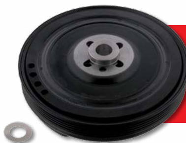
TVD crankshaft pulley rep. kit