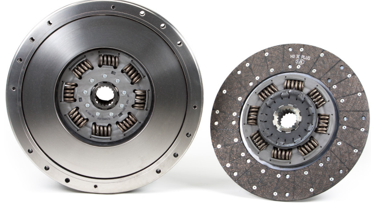
Fig. 2: LuK double disc clutch with same hub profiles