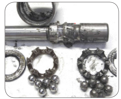
Examples of a damaged water pump: