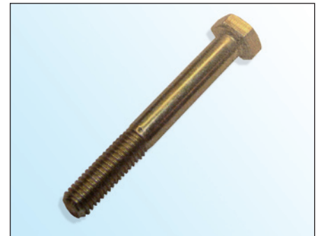
Fig. 2: OE bolt

As part of the continuous development of our products and quality assurance, LuK AS now supplies a new bolt (fig. 3) with the tensioning pulley 531 0274 30.