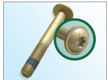
Fig. 3: LuK AS bolt

LuK AS recommends replacing the original bolt (Fig. 2) with the supplied bolt.