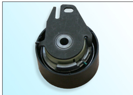
Fig. 1: OE-Type

Both tensioning pulley types are approved by the vehicle manufacturer.