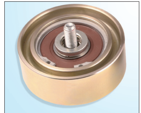
Fig. 2: 532 0294 10 (new Version)

As part of the ongoing development of our products, we have changed the bearing surface of idler pulley 532 0294 10 from plastic to metal.