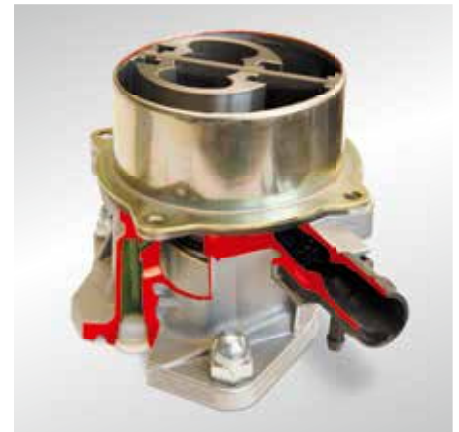
Latest development: single vane vacuum pump (cutaway model)