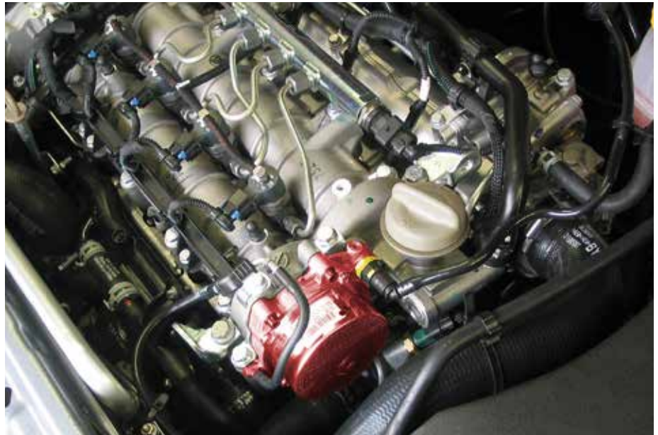
Vacuum pump in the Opel Vectra B (in red)

Since failure of the brake boosters can lead to dangerous situations, the vacuum pump is considered to be a safety component.