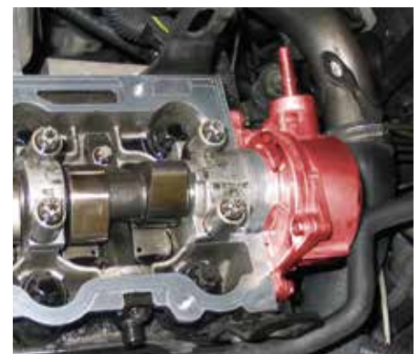
Vacuum pump and camshaft in the Opel Vectra B (in red)