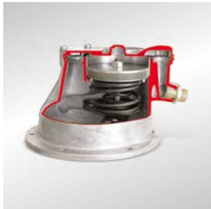
A traditional piston vacuum pump (cutaway model)

New developments tend to combine pumps supplying different media (tandem pumps): Combined fuel/vacuum pumps are situated on an axle shared with the camshaft. Combined vacuum/oil pumps are installed in the oil pan.