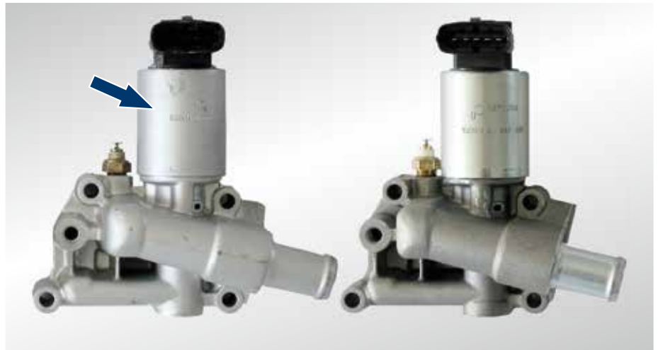
Image 1: A painted EGR valve (arrow) looks like new – but it is not.

In general, components of an older model series are reconditioned; i.e. technical innovations have not been implemented in this product.