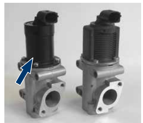
Image 5: Original coil body was replaced by simple turned part (arrow).

We recommend using only new EGR valves. The potential price advantage with reconditioned EGR valves compared to a new part is eliminated by a shortened product life and thus more frequent servicing costs.