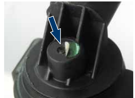
Image 2: This bore (arrow) can lead to water penetration and failure.

Image 2: For reconditioning, the coil body was drilled open, the inside of the coil was pushed out and cleaned. After re-assembly, the bore was glued and covered with a sticker. Coil and armature may have been damaged when they were pushed out. Water can enter through the hole and cause damage.