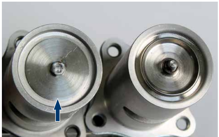
Image 4: A welded-on metal plate (arrow) is not a substitute for a valve seat.

Proper reconditioning can be done only if worn or damaged components are replaced with new components in OEM quality – cleaning and painting does not suffice.