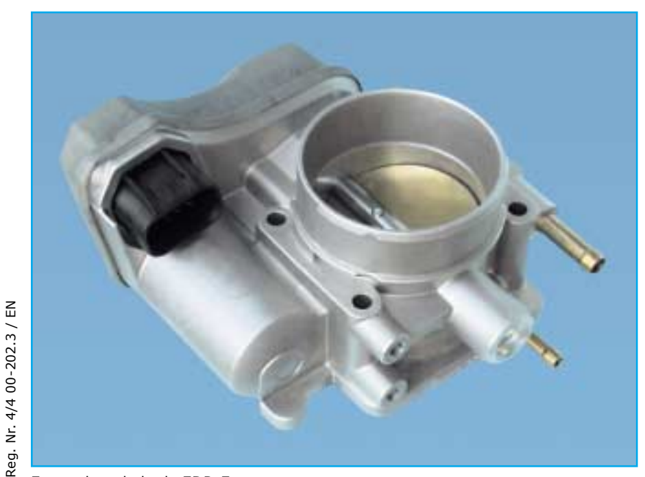
E-gas throttle body EDR-E