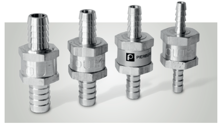
Fuel check valves 6-12 mm

Do not use any material combinations which cause corrosion or contact corrosion with aluminium, e.g. salt water or galvanised surfaces.