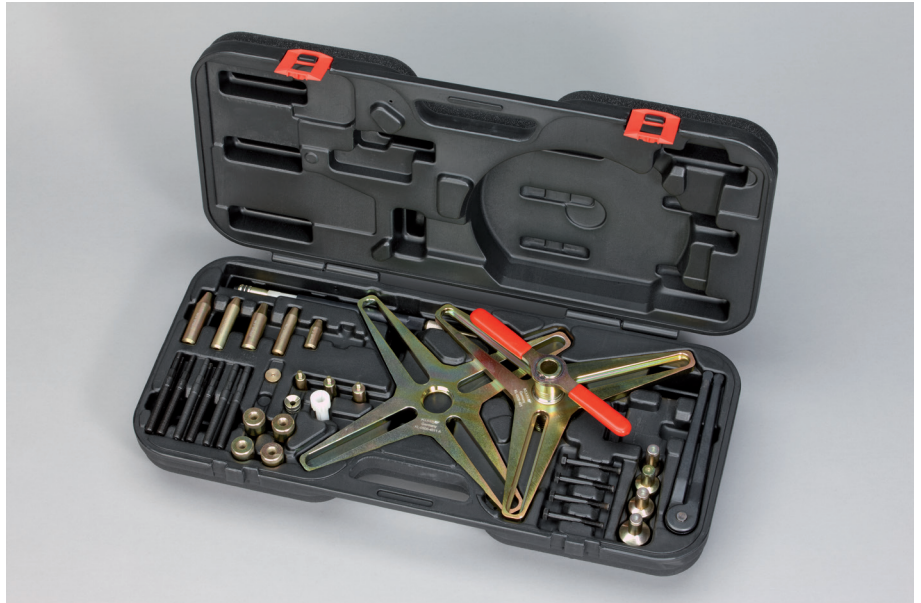
Image 2: 400 0237 10 - The new kit with additional content

The additional tools (see image 3, 5 and 7) can also be purchased individually to add to the previous case.